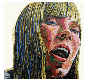
Joni (detail), 27" x 48," collaged acrylic paint skins, 2017, by Jennifer Wigmore

Jennifer Wigmore is teaching the following Continuing Studies courses this winter: Intermediate Figurative Painting: The Narrative Body , starting January 15, and Professional Practice for Emerging Artists , starting January 19.