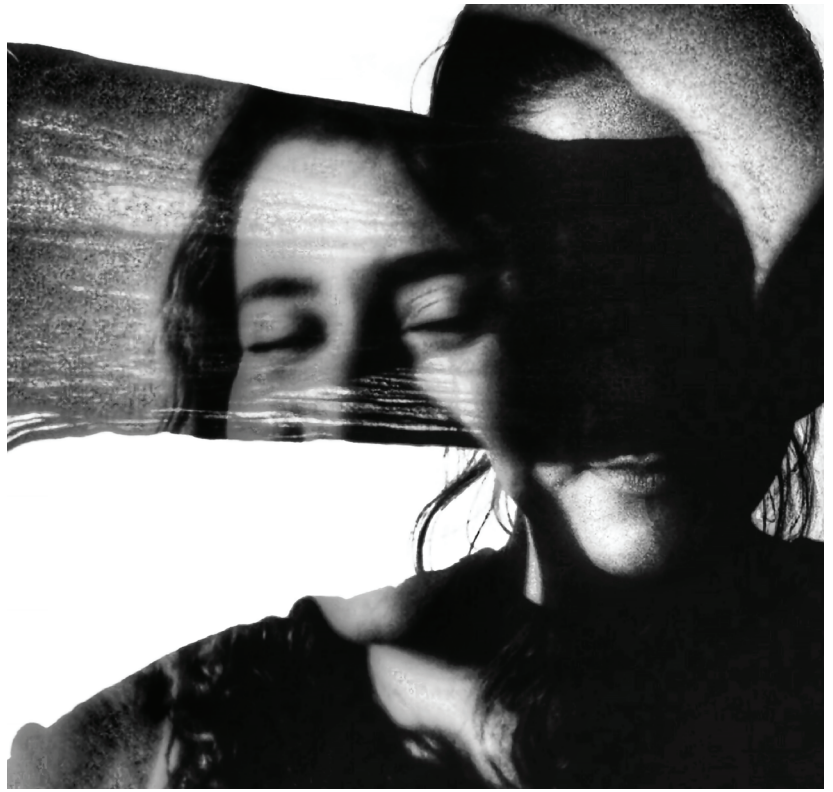
from the fall Continuing Studies exhibition, Between the Lines

■ This course is an introduction to screenwriting for short screenplays. Through lectures, screenings, group discussions, and critiques, students will