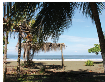
Photograph by Sarah Trnum, instructor of the Social Innovation Design Abroad course

Working in multi-disciplinary teams, students will apply lessons in the field to hands-on activities that will lead to the design of robust solutions. Overnight and day trips as well as a variety of enriching activities throughout the 10 days will allow students to be fully immersed in the local culture.